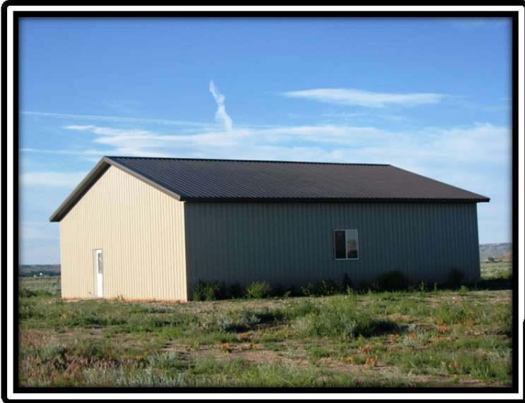
Exterior Views of Shop