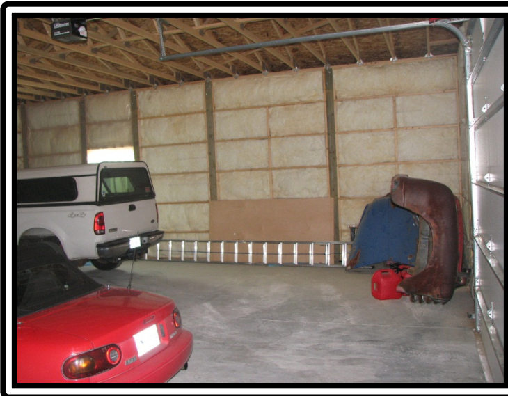
Interior Views of Shop