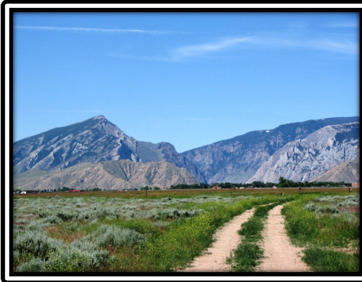
Clarks Fork Canyon